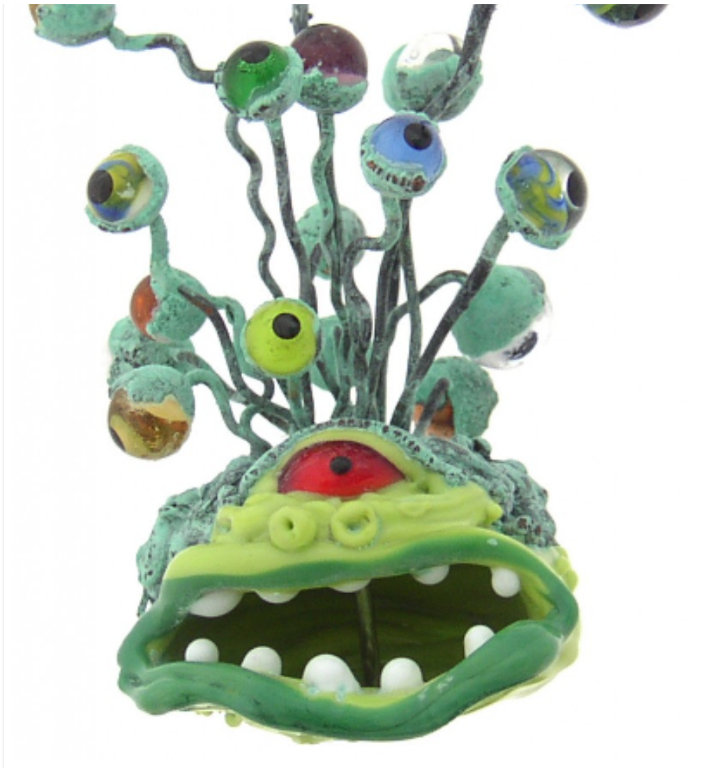
— “Blind Spot” Ralph McCaskey September, 2007 Soda Lime glass, copper, verdigris patina 2” x 2” x 3.5”